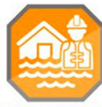
Works In, Over or Near Water