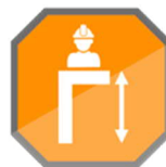
Working at Height