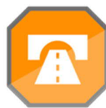
Work Related Road Risk