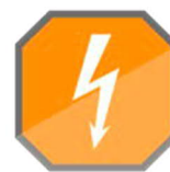
Electrical & Stored Energy