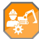
People & Plant